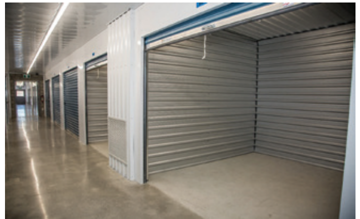
Indoor Heated Units - Various Unit Sizes