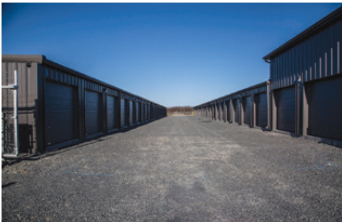
Drive-Up Non Heated Units and Drive-Up Heated Units